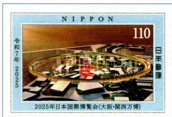
Design 1 - Perspective view of site