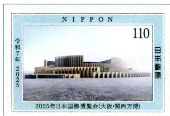
Design 4 - Japan Pavilion