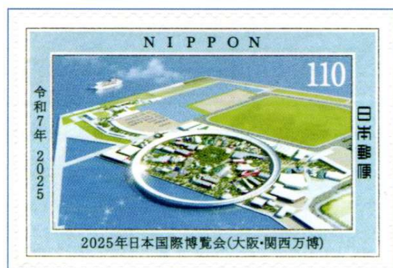
Design 2 - Perspective view of site