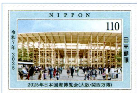
Design 3 - Great Roof of the Ring